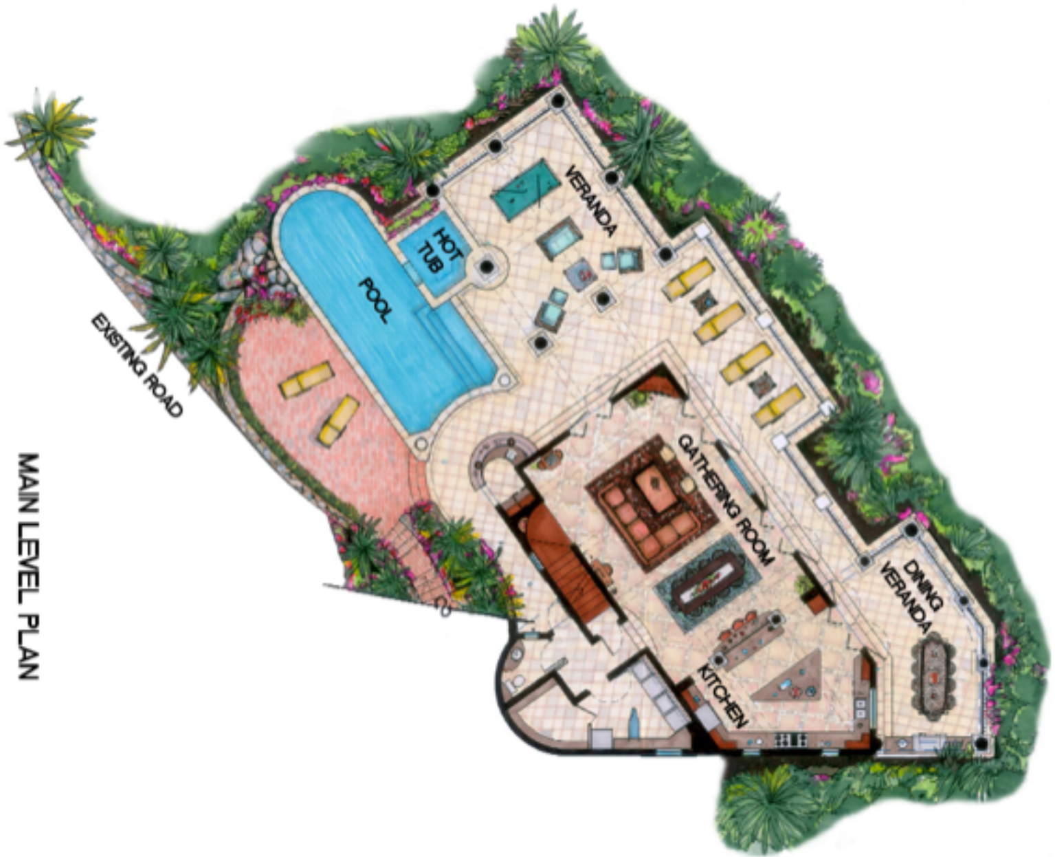
MAIN LEVEL PLAN