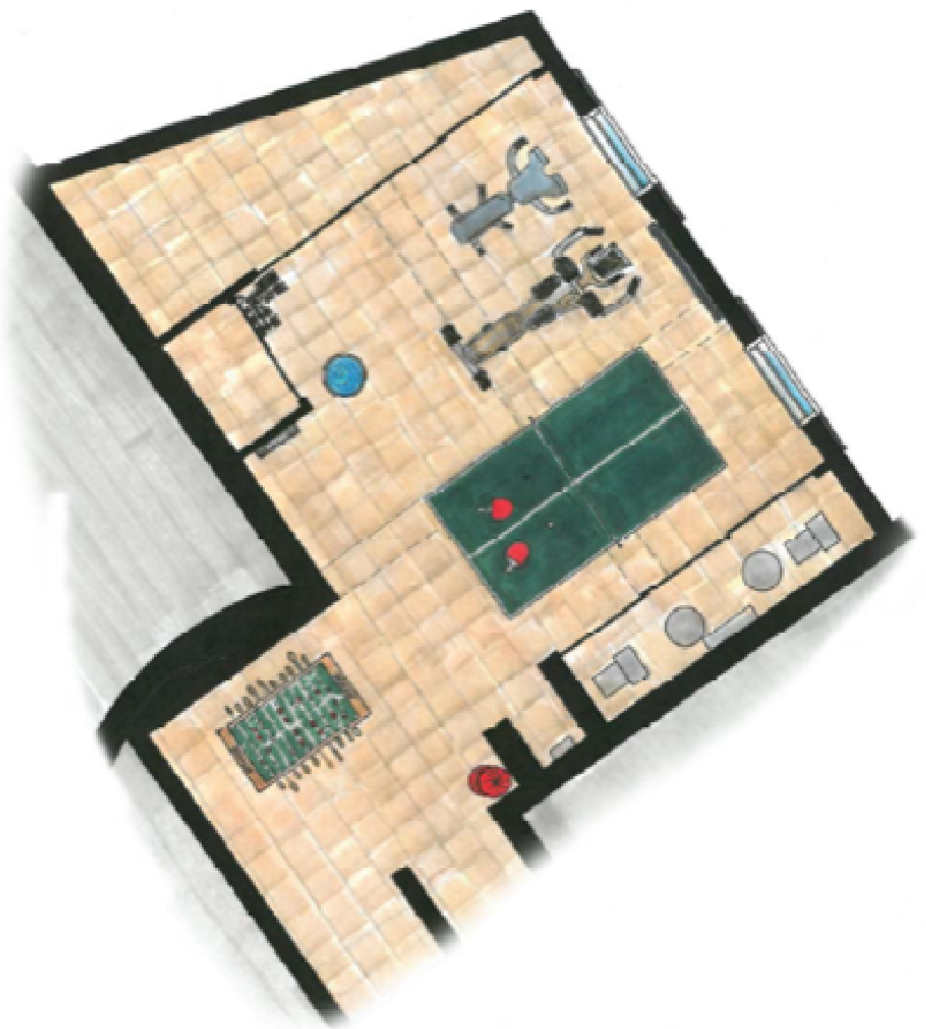
EXERCISE ROOM ● CISTERN LEVEL