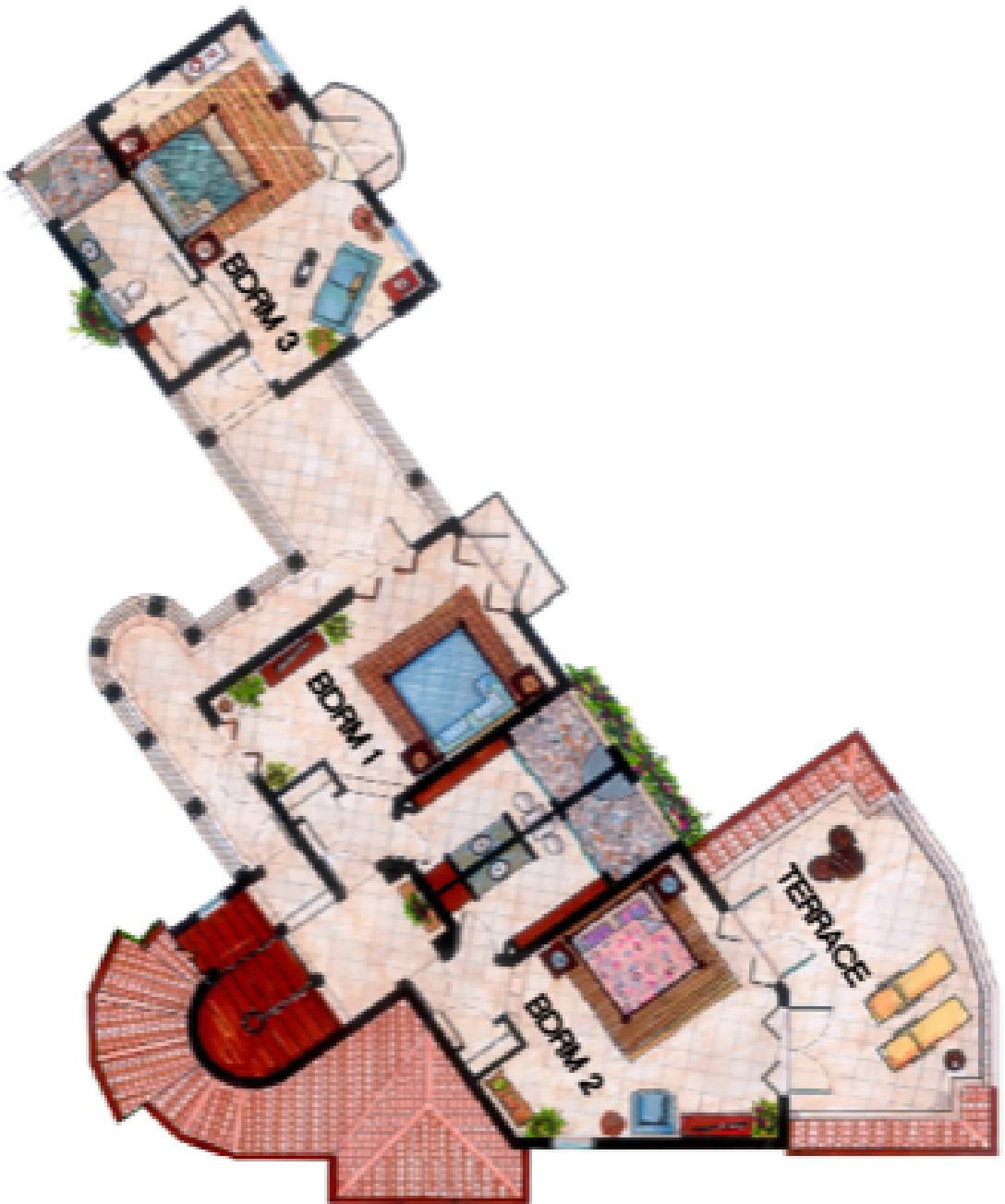
UPPER LEVEL PLAN